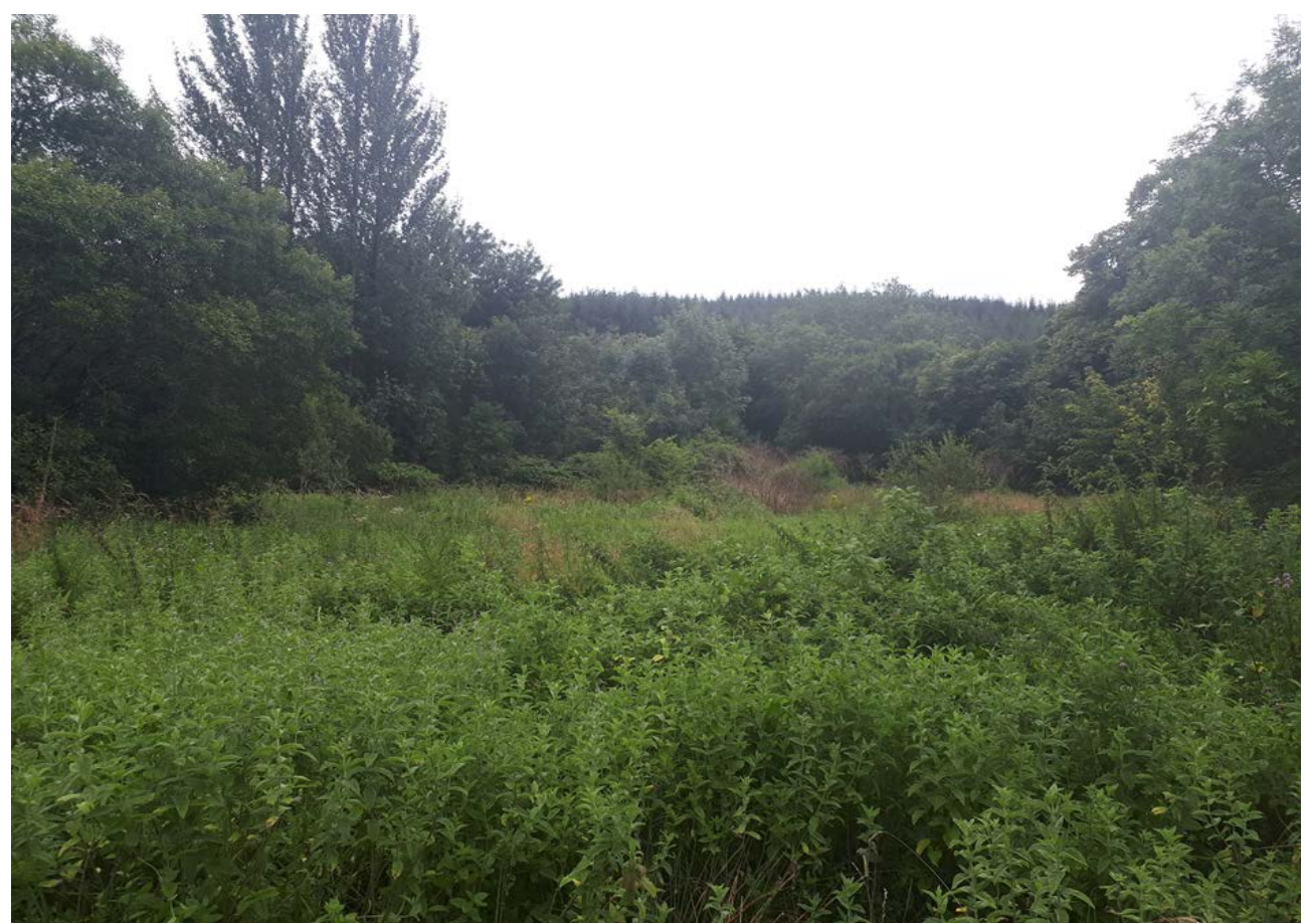
Looking southwards through the centre of the site

Although not forming part of the application site for the adjacent residential development, an ecological appraisal was carried out in support of the adjacent development and the study area included the current application site. This assessed the site to be a mix of plantation woodland, neutral grassland and swamp of low ecological value. Whilst this study considered the impacts on flora and fauna it was appropriate to request a new preliminary ecological assessment to update the original report given the passage of time since the original study was carried out. This was completed by the applicant and considered and accepted by the Council's ecological adviser. Conditions will be required to address bird breeding season and an element of biodiversity gain but the report was accepted in general terms.