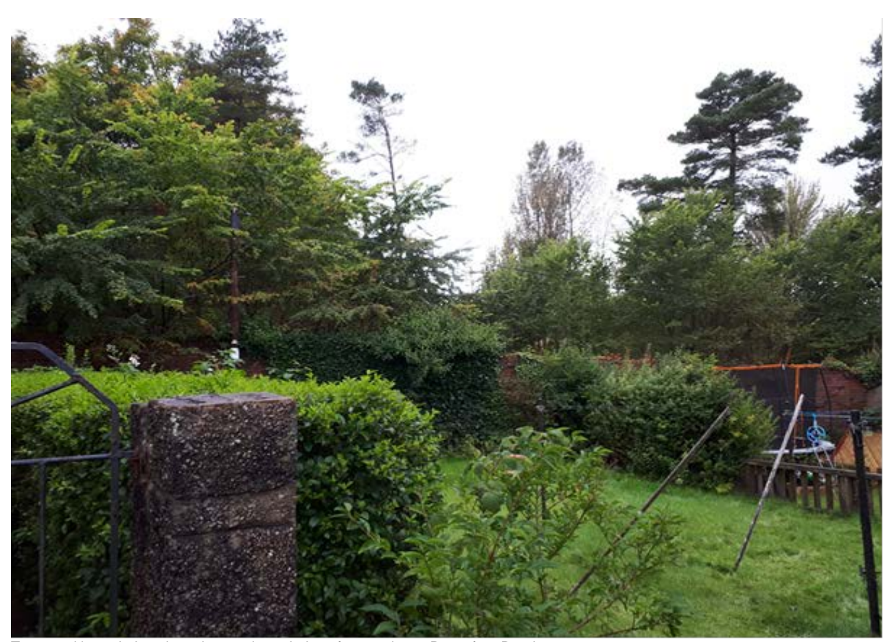
Trees and boundaries along the rear boundaries of properties at Pennyfern Road

The proposal involves the planting of native species which will create a new habitat for wildlife and provide new links to the green network. The proposed footpath links to the Greenock Cut will result in footpath links being established where there are presently none. Furthermore, the proposed footpath links and the general clearance work will open out the site and create passive surveillance which will help to address the present anti-social problem. The applicant is also to provide stone filled trenches to address the current water ingress problems from the site experienced by neighbouring residents on Pennyfern Road.